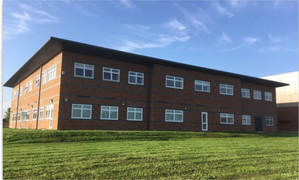
Subject discussions in I and K blocks